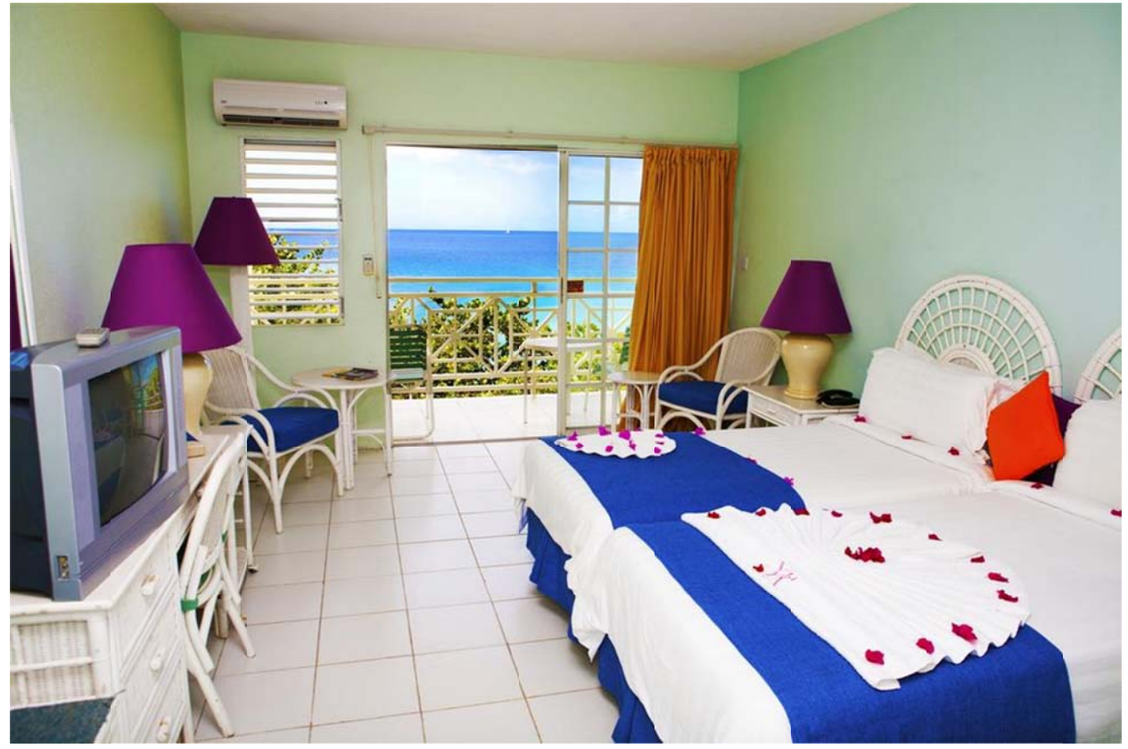
The Grenadian by Rex Resort